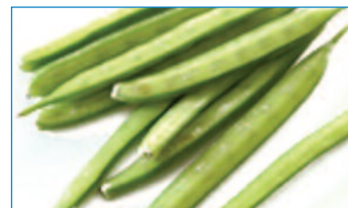
Guar beans, the source of guar gum, one of the fibers found in Biosphere Fiber.

Biosphere Fiber is a blend of five soluble fibers that are able to curb cravings, maintain healthy lipid levels, and help with weight loss.